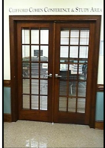
View of the Clifford Cohen Conference and Study Area from the new kitchen space