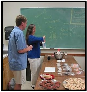
Refreshments served in the old Cohen Room

Beyond new technological capabilities, the Clifford Cohen Conference and Study Area now offers a more