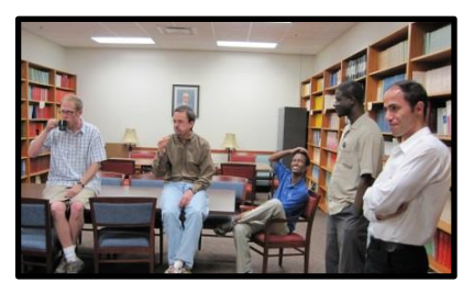
Students socialize in the old Cohen Room

The Cohen Room, now The Clifford Cohen Conference and Study Area, is still the central meeting point for the department and is available primarily as a student study area when not in use for meetings. As before, there is a small kitchen area separated from the conference room so that students may