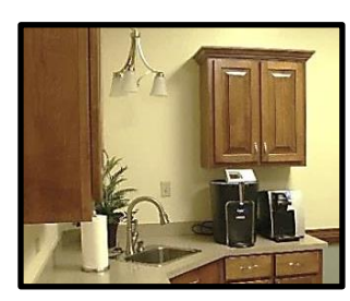
The new kitchen area