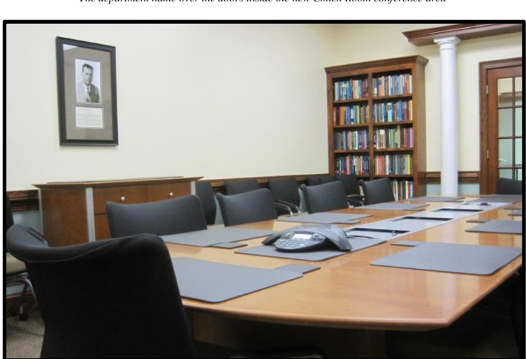
{\it View from the speaker's podium of the new conference table and Dr.\ Cohen's portrait}