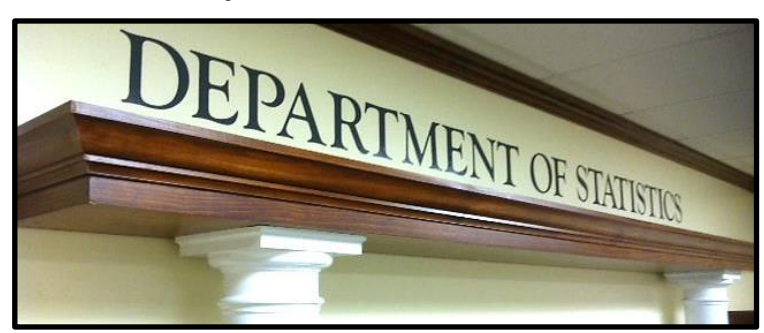
The department name over the doors inside the new Cohen Room conference area

professional, multi-use space for studying, meetings, and events. It is truly a point of pride for the department. We welcome our alumni and friends to visit us and enjoy this new addition!