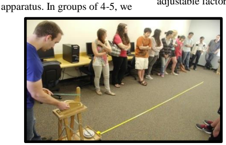
Students watch as the first ball is launched

may not affect the launch distance: launch arm length, ball type, stop angle, anchor height, and catapult height. Through statistical analyses and diagnostics, the experiment aimed to determine the significance of each factor and interaction effects as it relates to launch distance.